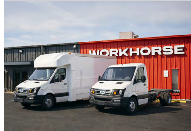
W750 Step Van and W4 CC Cab Chassis Class 4 Medium-Duty