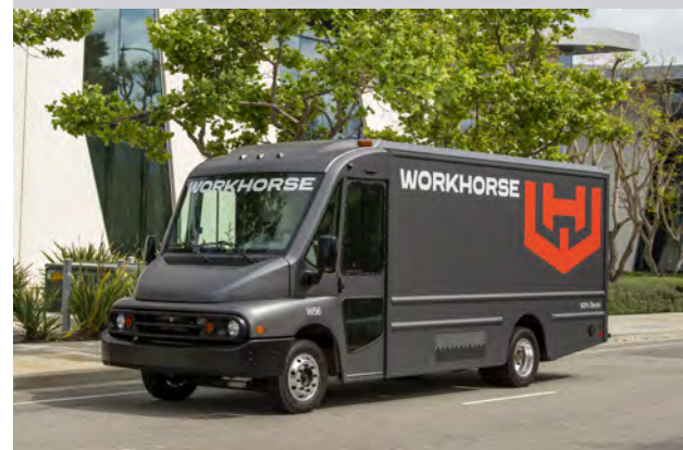
W56 Step Van Class 5/6 Medium-Duty